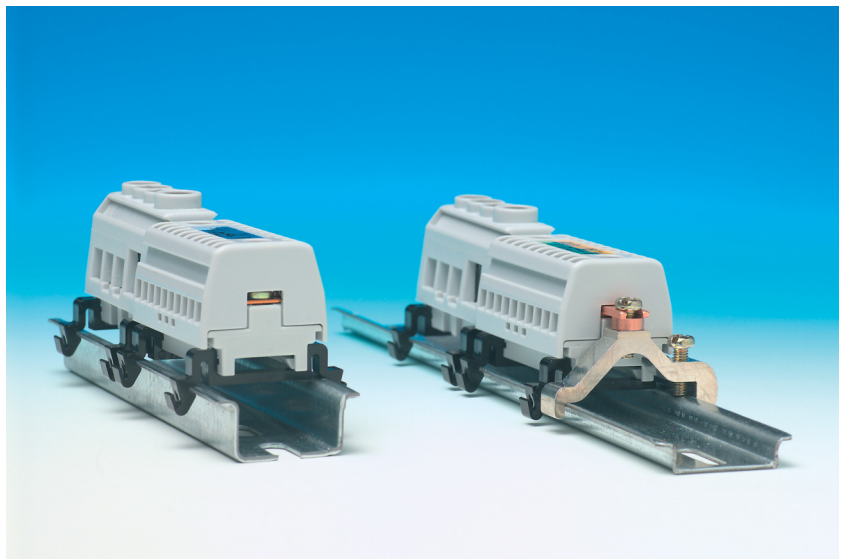
The terminals can be directly mounted onto a DIN 15 rail and onto a DIN 35 rail using an adapter. The new adapter KNL 7 with a new design makes it possible to mount the terminals also on the high DIN 35 rail.

To get acquainted with the Ensto Clampo series screwless terminal, please take a look at www.ensto.com .